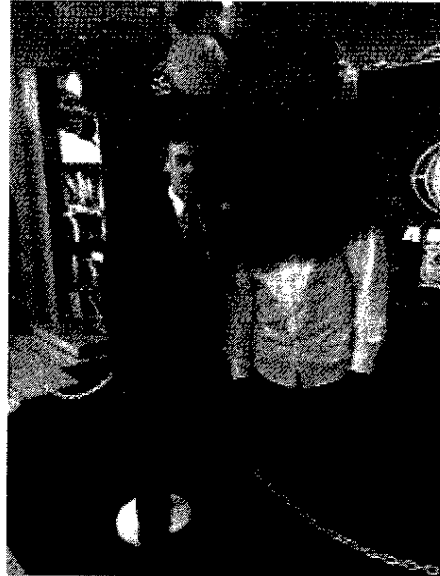
Who's Guarding Who?