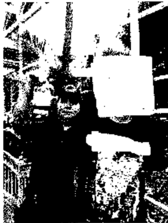
W . . .

On 7-2-14, Sgt. McCall and Officer Goddard arrested W . . . for drinking in public in front of the Motel 6 located at 1730 Whitley. We have been providing extra patrol as this area has become a hotbed for narcotics sales.