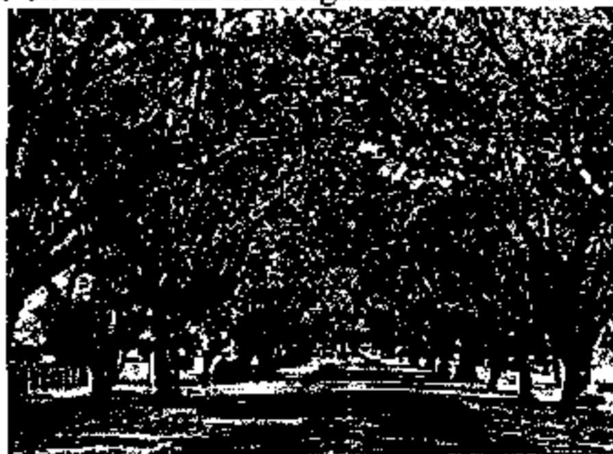
The Mighty Jacaranda