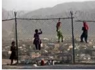
File Photo of Teachers Escaping Classroom

On 1-31-14, we once again lived up to our reputation as problem solvers. Selma Elementary School teacher Brandy worked late and got herself locked in on campus. Our Officers saved the day by helping her to climb over the fence.