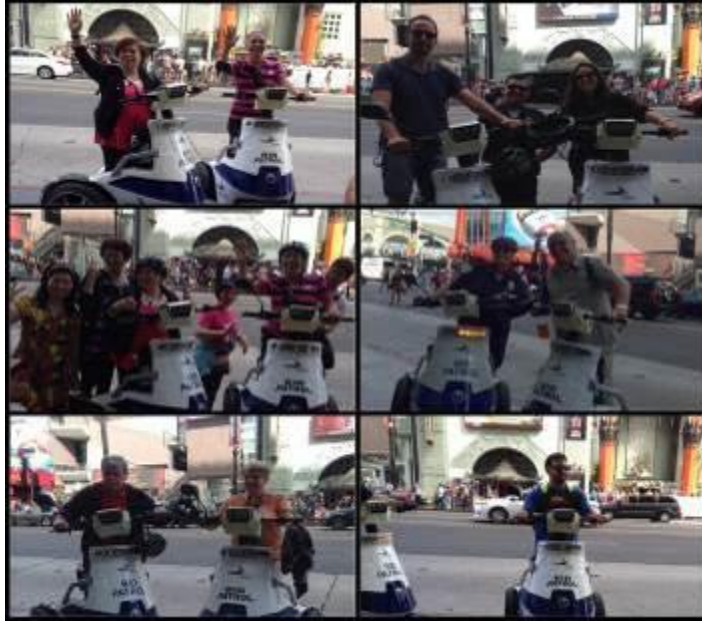
Tourists from China, France, Spain and Australia