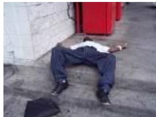
Welcome to 7-11

On 3-22-14, our Officers found a man sleeping on the ground at 1810 Cahuenga. He was woken and sent on his way.