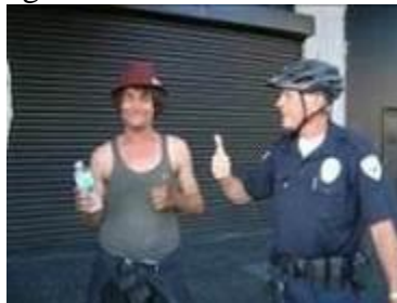
Happy Hydrated Homeless Hipster