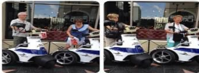
Four From France Pose