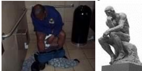
Our Version of The Thinker

On 2-14-14, we received a call of a man refusing to leave the bathroom at the Jack in the Box located at 6407 Sunset Blvd. Our Officers found a man passed out sitting on the toilet. After considerable effort, he was roused and sent on his way. It is surprising how many times we have encountered this scenario throughout the BID.