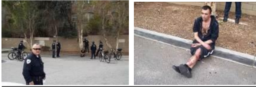
Glamour Breaks Out Once Again