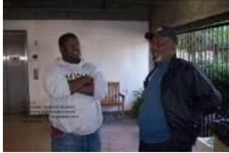
Johnny File Photo

We have found that simple human kindness can help us build the rapport necessary to help convince someone to make the move to leave life on the streets.