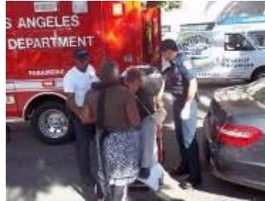
Danielle and Baby off to Hospital

On 10-16-13, our Officers found a man down at the Taco Bell located at 6398 Lexington. Paramedics were called and RA 27 responded and treated the man at the scene.