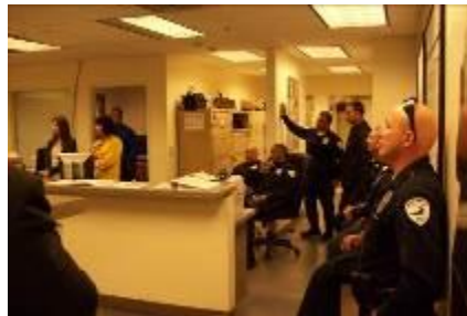
Mental Illness Issues Training

There was a good dialogue after the training. We see this as the first in a series of similar training for 2014.