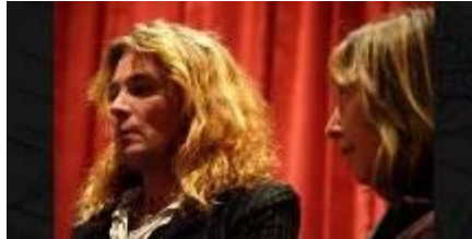
At Advanced Screening for Skid Row Documentary