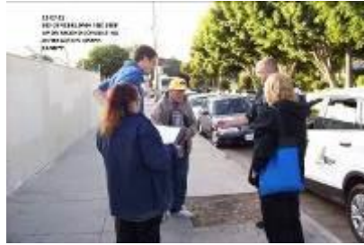
BID, Step Up and Dept. of Mental Health