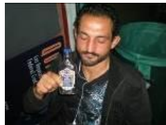
Taaka Strikes Again