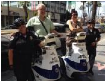
The Spaniards Join the Fun