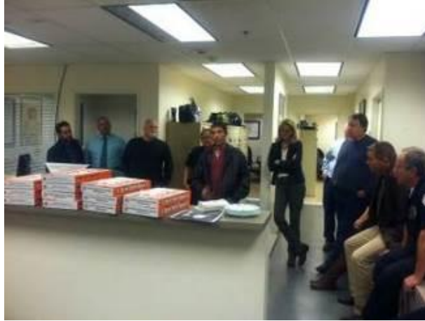
George Addresses the Troops