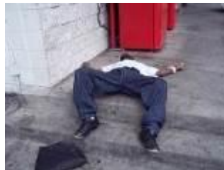
Welcome to 7-11

On 3-22-14, our Officers found a man sleeping on the ground at 1810 Cahuenga. He was woken and sent on his way.