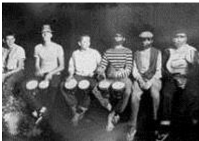
Back off Man!

On 3-19-14, our PSO's spoke to three men who were lying on the sidewalk at 7080 Hollywood Blvd. with their three dogs. They asked the men if they wanted outreach help. One of them replied "No, we are travelers and don't want to be held to rules of the corporate man".