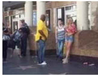
Suspect Finds New Victims