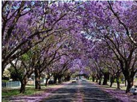
The Mighty Jacaranda