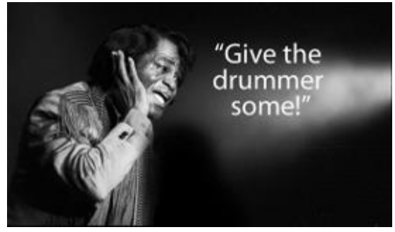
Clyde Stubblefield and the Godfather of Soul