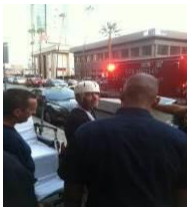
Man Gets Help

The man seemed confused and had trouble responding to simple questions. Our officers called Paramedics and they believed that he needed emergency care. They then took him to the hospital.