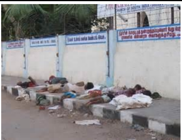
Sidewalk Without BID Patrol