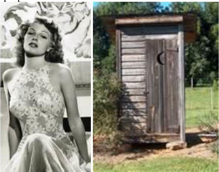
Hollywood Glamour Not Hollywood Glamour

In recent weeks, staff at the Methodist Church located at 6817 Franklin have reached out to us for help. There are people sleeping on their steps and one man in particular defecates there. We have been patrolling each morning and evening and giving warnings. On 8-8-14, Officers Ayala, Coogle and Parra went to the location at 6:00 A.M. They found 3 people who were just getting up. As they left there were 3 piles of feces left behind. The people were warned.