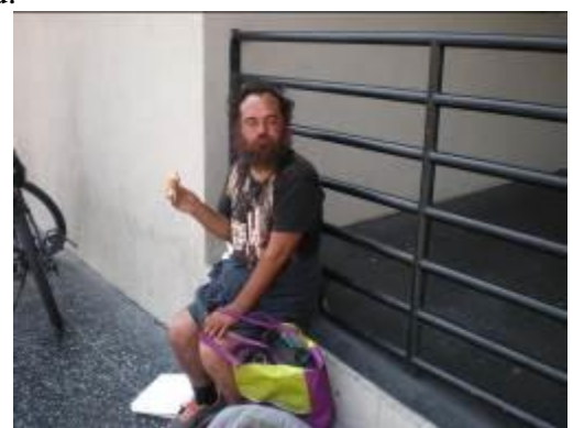
Less Angry Jaime

refrain from creating problems on the Blvd. It may sound crazy, but we have seen great success with this method.